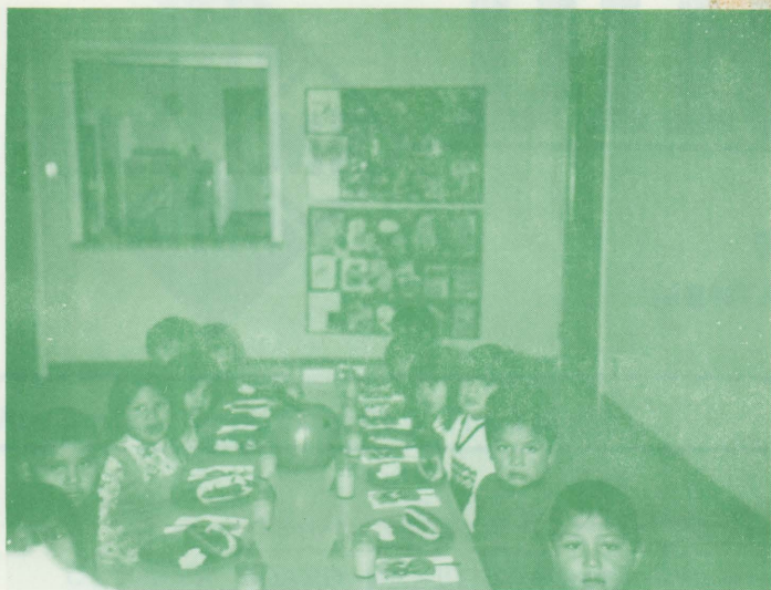
HALLOWEEN AT THE ALABAMA-COUSHATTEA DEVELOPMENTAL CENTER